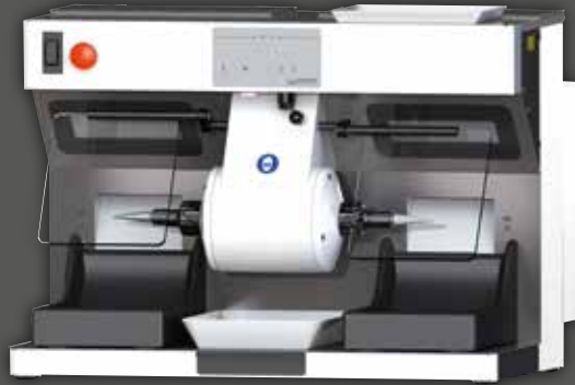
WP-Ex 2000 II (2 settings, 1500 / 3000 min -1 ), basic equipment