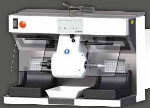
WP-Ex 2000 II with special accessories daylight LED spot and suction protective grids